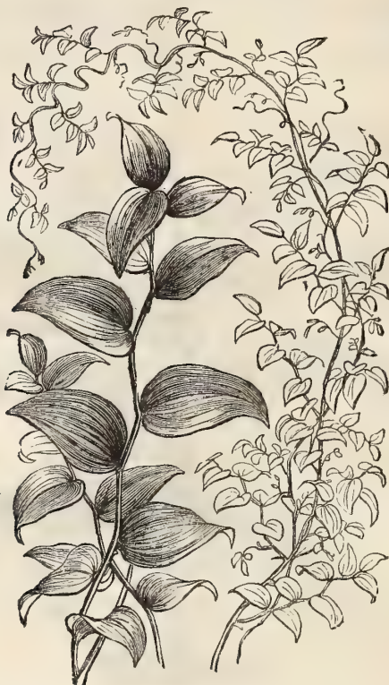
MYRSIPHYLLUM, OR SMILAX.